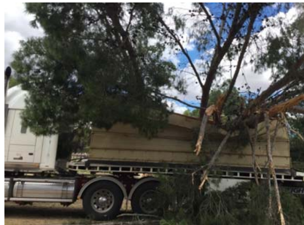
Unfortunately further storms resulted in significant clean up and damage across the entire Council area

Localised and short term inundation occurred on roads and private property in most townships.