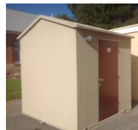
The previous toilets at the Recreation reserve and Memorial Institute (left) have been replaced with a modern version (right)